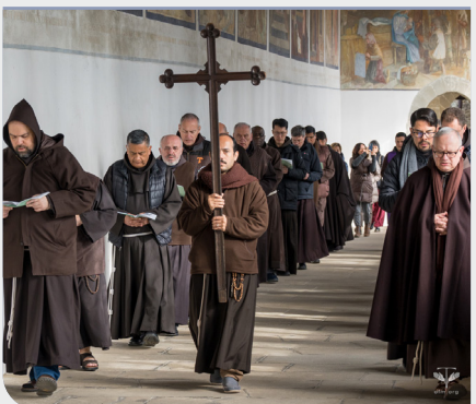
Retreat of the Fraternity of St. Mary Mediatrix in La Verna (General Curia)

Course for OFS and YouFra Spiritual Assistants of the Croatian Provinces