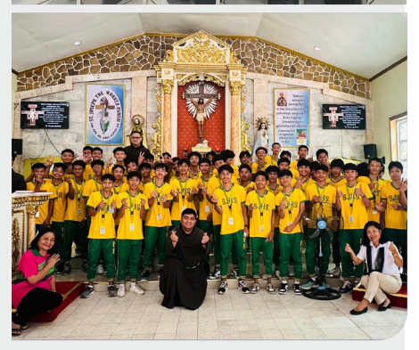
School Vocation Campaign, Province of S. Pedro Bautista (Philippines)

AGAINST THE EXTRACTIVE INDUSTRY AND THE EXPLOITATION OF THE COMMON HOME